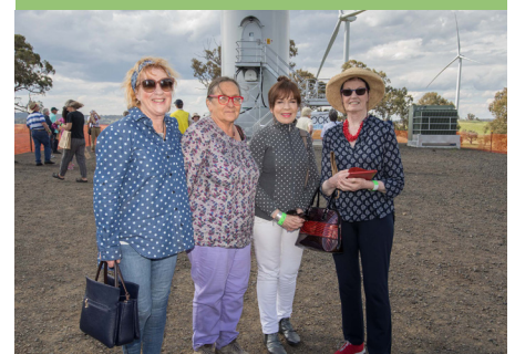
Local community members attending the White Rock Wind Farm Open Day.

People gathered as early as 8am at the old Glen Innes Railway Station to take one of chartered buses to White Rock Wind Farm. Onboard the bus with a guide, visitors could ask questions about the project. Once on site, groups were able to stand underneath a turbine, and the Operations Manager and technicians were on hand to