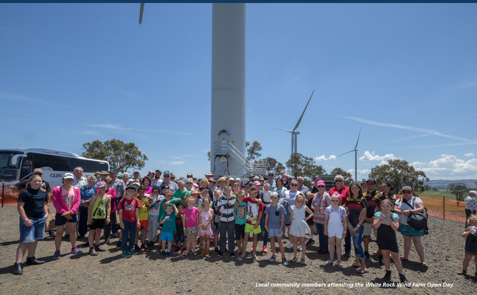
Local community members attending the White Rock Wind Farm Open Day.